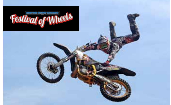
WE HAVE A FAMILY CAMPING TICKET TO GIVEAWAY