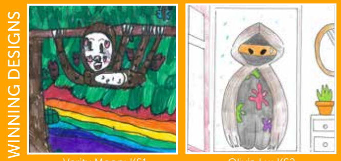
Verity Moon: KS1

"I have thoroughly enjoyed looking at the amazing bright and bold Character Creations the children have drawn, showing their wonderful and vivid imaginations and extraordinary creativity. I am delighted to have been able to support Home-Start in Suffolk and the families they work with across our county."